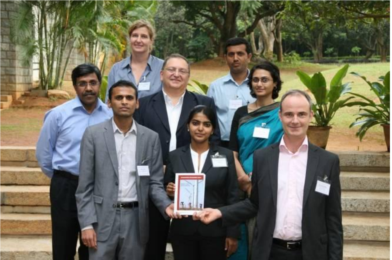
Photo 5: Delegates thinking about global challenges and opportunities in the energy sector