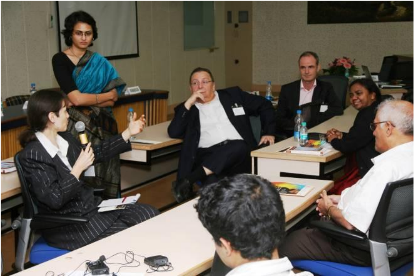
Delegates were keen to discuss further during tea breaks and lunch