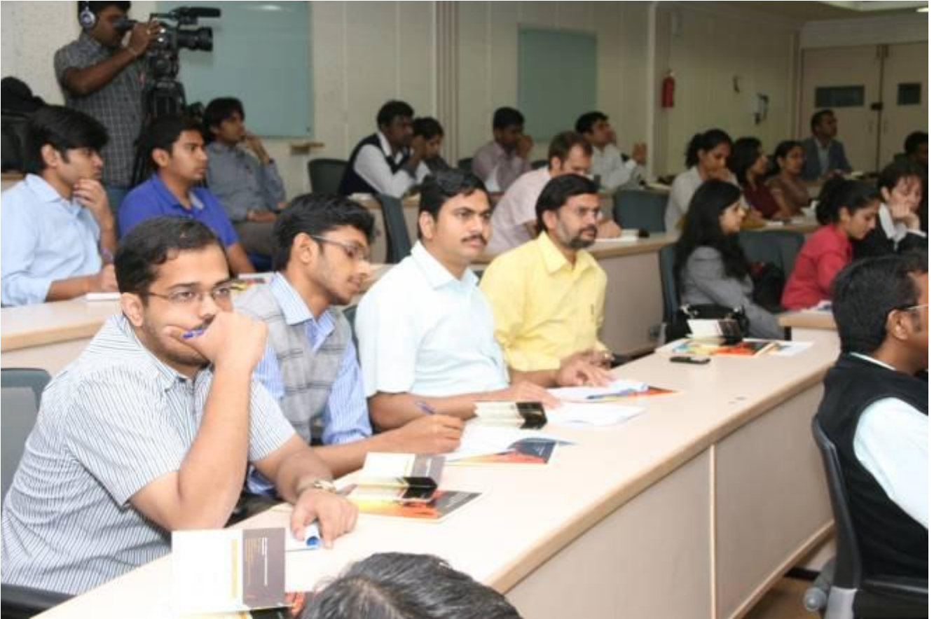
Photo 7: Delegates thinking about global challenges and opportunities in the energy sector