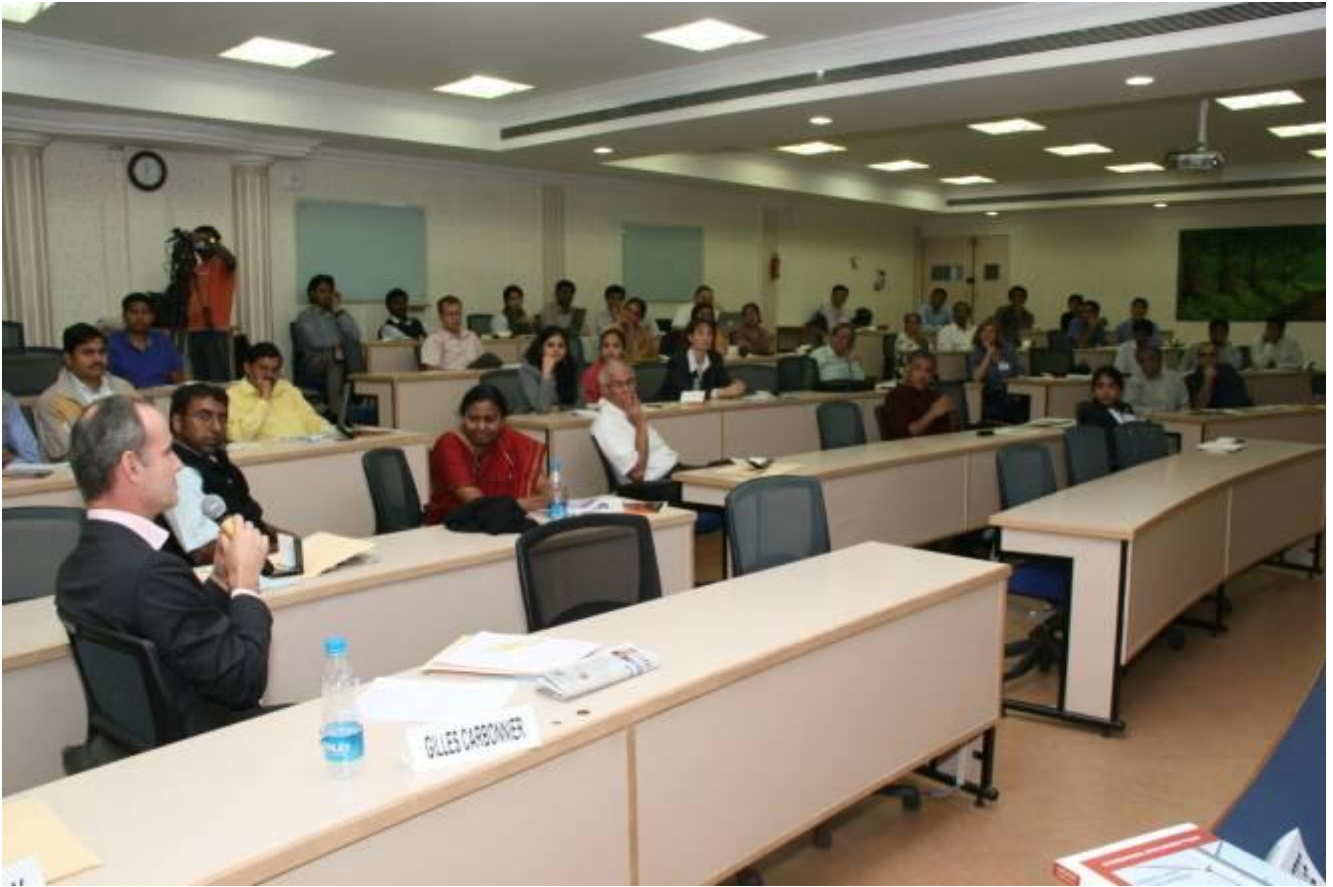
Photo 9: Round Table Discussion with intensive participation from Delegates and the Panel.